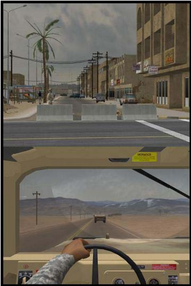
Fig. 1 Scenes from Virtual Iraq and Virtual Afghanistan

noise, prayer call, etc.). As well, we now have created visual elements that can be selected to resemble Afghanistan scenery and architecture to broaden the relevance of the application for a wider range of SMs.