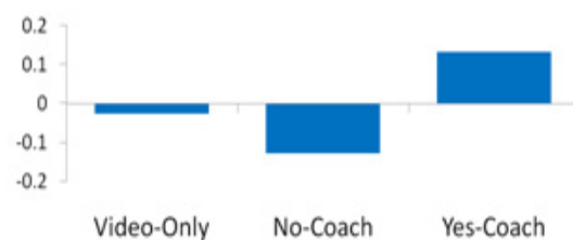
Figure 3. Changes in correlation with experts on meeting-phase-specific prompts (by condition)

Ballpark scores on phase-specific questions. Figure 4 presents the ballpark data for the three conditions in our experiment. Again, playing BiLAT and receiving real-time feedback from IGEL resulted in somewhat superior comprehension and retention of the LOs related to meeting phase: F(2, 27) = 1.681, p = .205 . Post-hoc tests revealed a marginally significant difference between the superior yes-coach and the inferior video-only conditions: t(19) =