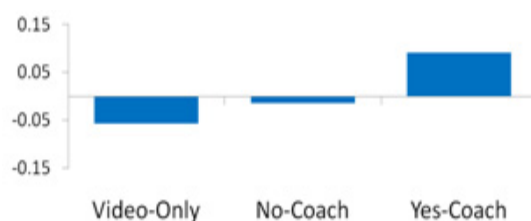
Figure 4. Changes in “ballpark” score on meeting-phase-specific prompts (by condition)