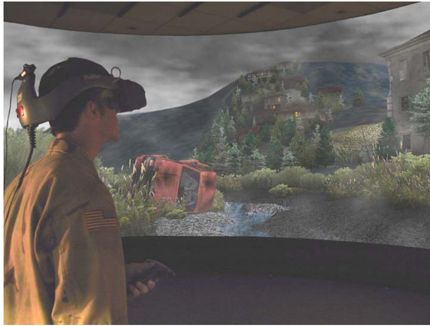
Figure 1: A participant in the HMD and a scene from the VE experiment world: DarkCon

The experiment required each subject to play the role of a forward scout in a military-style scenario, and to determine whether rebels or refugees inhabit an area of suspicion. In this regard, the mission (as described in the priming videos) is basically an observational exercise, but we add a simple objective of dropping a GPS transmitter near a specific building if enough clues indicate that rebels are inhabiting the target area. Because this virtual mission takes place at night we have named it DarkCon (see Figure 1).