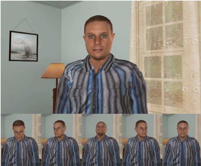
Figure 2: The gaze behavior of the Rapport Agent. On the top is the gaze behavior of the agent in the Responsive and Staring condition. At the bottom is the gaze behavior of the agent in the Ignoring condition.

The study design was a between-subjects experiment with three conditions: Responsive ( n = 51 ), Staring ( n = 47 ), and Ignoring ( n = 46 ), to which participants were randomly assigned.