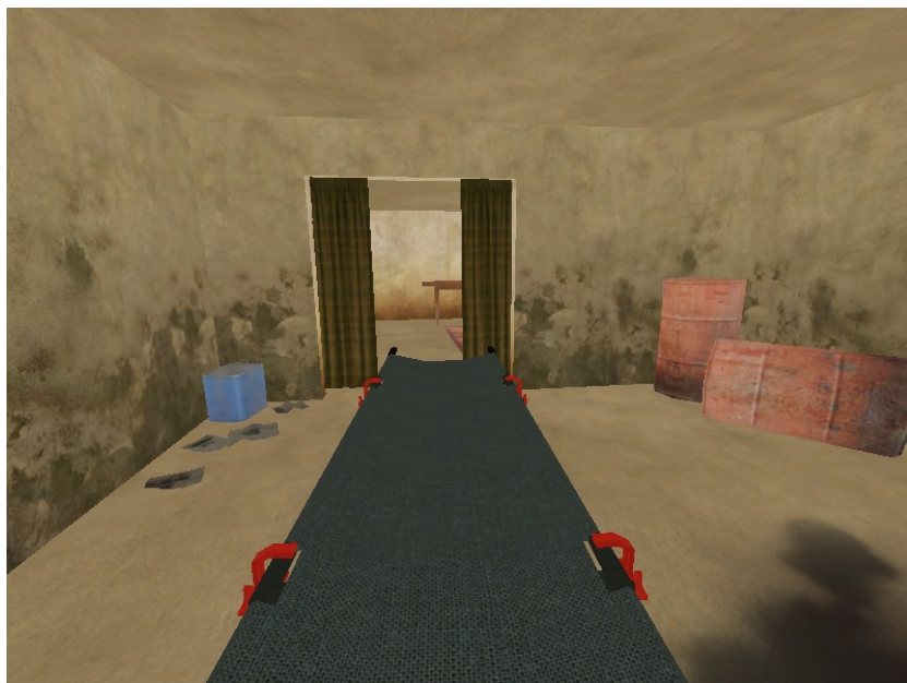
Figure 2: Force sensitive cart compresses space in this gurney scenario.