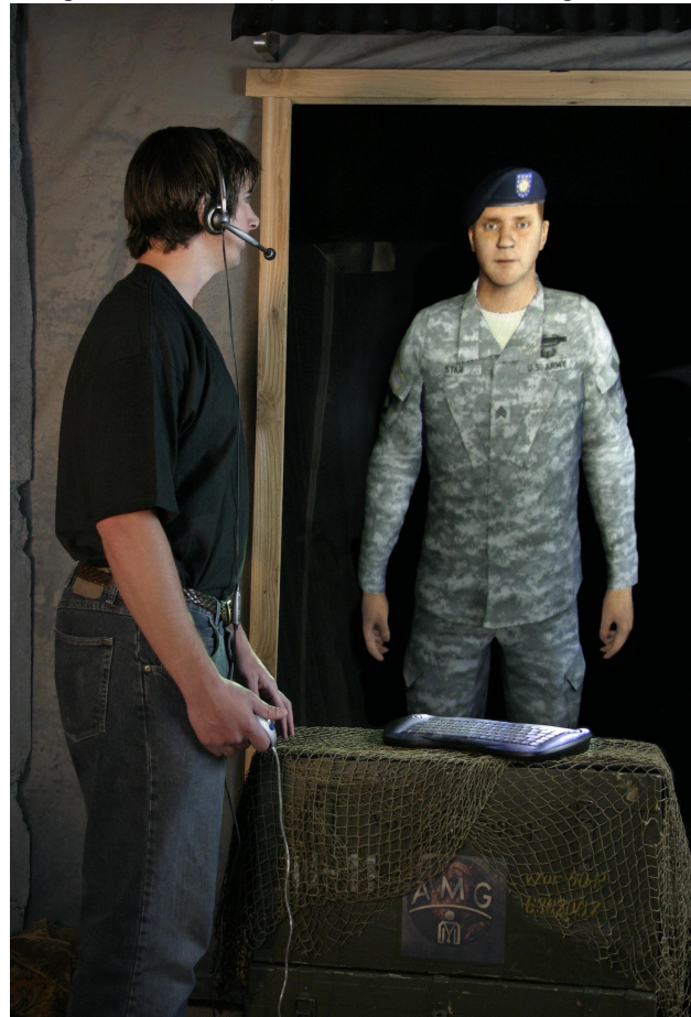
Figure 3: SGT Star, a virtual human presented on a trans-screen

Employing wide field of view displays like one of the new generation of wide HMDs (providing up to 150 degrees), the lab is exploring the ability to create uniquely compelling experiences with virtual humans. Peripheral vision cues, previously unavailable using standard HMDs, engender a variety of spatial cognition and pre-attentive behaviors that appear to be important in engaging users into a situation. Some photographers anecdotally mention that they feel as if they are detached observers of real world events. While some of that disengagement comes from their journalistic role, perhaps the limited field of view of a camera lens may play a part by lessening the immersion that photographers feel with the real world. This line of thought leads to questioning if a narrow field of view HMD could limit the sense of presence of virtual characters.