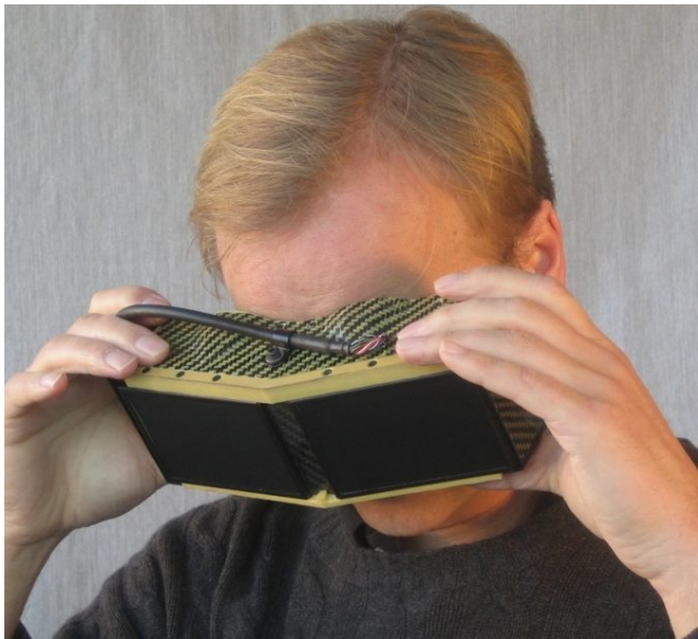
Figure 1: Wide5 Head Mounted Display with a 150 degree field of view.

A variety of hardware has been devised to allow free locomotion while confining the user to a small area. These include omni-directional treadmills, unicycles, and large “hamster balls” within which users can walk or run [Darken1997, VSD2006, Cyberwalk2005, Ackerman2006, Templeman1999, Kaufman2007]. However, there are some differences between normal locomotion and device borne locomotion. Omni-directional treadmills detect the location of the user and apply appropriate translation to bring the user back to the center of the treadmill. Thus, omni-directional treadmill experiences present some time lag related to determining user position and direction, as well as the actuation of a large mechanism. “Hamster ball” style devices induce lag due to the rotational inertia of the large sphere. Both forms of lag can become apparent under sudden changes in speed and direction, requiring changes in locomotion on the part of the user, additional training, and perhaps safety harnesses or other protective gear.