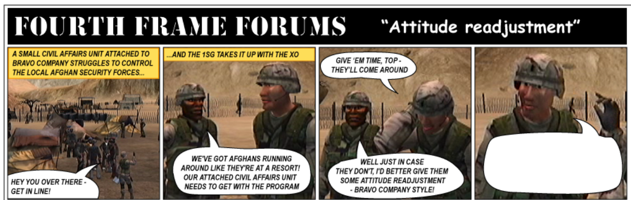
Figure 2. An example Fourth Frame Forum episode

The final step in authoring an episode was to realize the episode description as a four frame graphical comic using the conventions of the genre [7]. Artistically inclined developers may choose to hand-draw the episodes in the traditional manner of comic strip creation, whereas others may find it easier to start with photographs of posed character models that can be edited using commercial drawing applications. In developing four example Fourth Frame Forum episodes in support of US Army leadership development, we chose to start with single frames of a series of machinima-style cut-scene videos of 3D virtual characters taken from an existing training application [3]. Individual video frames were selected that approximated the intended descriptions of each comic frame, cropped to focus on the relevant characters and