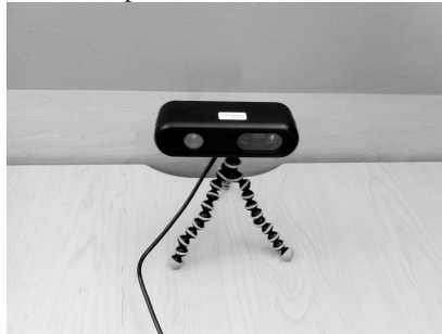
Fig. 1. PrimeSense Reference Design USB plug-and-play device

Full-body interaction with the game was provided by the PrimeSense Reference Design, a USB plug-and-play device that uses an IR projector along with standard RGB and infrared CMOS image sensors (Figure 1). To construct a depth map, the sensor uses a proprietary algorithm to resolve the pattern produced by projecting coded infrared light onto the scene geometry. This system has a field-of-view of 58 degrees horizontal and 45 degrees vertical, and generated depth maps with a resolution of 640x480 at 30 frames per second.