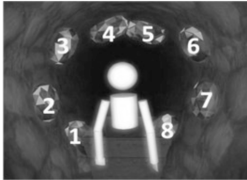
Fig. 2. The game is set in a jewel mine. The player's character is situated in the center of the mine shaft with eight gems placed around them in a ring

The game world involves a precious jewel mine where the player assumes the role of a miner who rides a railroad cart down a mine shaft and gathers jewels from the shaft walls. The shaft is uniformly cylindrical with eight jewels arranged in a ring with the player's avatar centered in the middle of the screen (Figure 2). In order for the player to successfully gather all the jewels they must reach out from the center of the screen and touch each jewel individually with their hand.