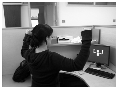
Fig. 3. User calibration step: The player must strike a default pose and the player's upper torso, arms, hands and head are represented on the screen

The game begins with a calibration step which maps the range of motion of the player's upper limbs. After striking a default calibration pose for a few seconds (Figure 3) the player's skeleton is captured and tracked without any attachment of devices or markers.