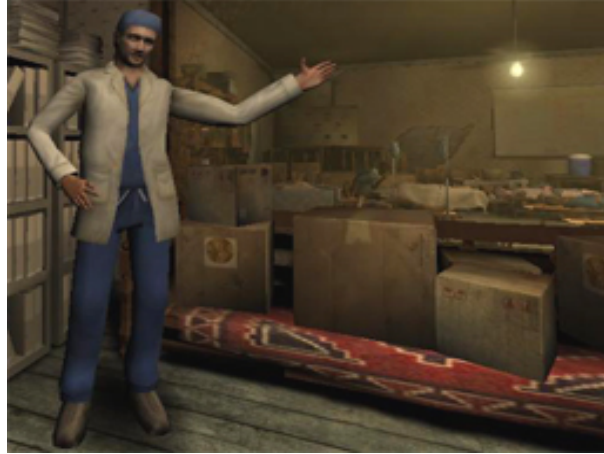
Fig. 1. SASO's SmartBody

a robust process that does not make any strong assumptions about markup of communicative intent in the surface text. Often such markup is not available unless entered manually. Even in systems that use natural language generation to create the surface text (e.g., Stabilization and Support Operations system [3]), the natural language generation may not pass down detailed information about how parts of the surface text (a phrase or word, for example) convey specific aspects of the communicative intent or emotional state. As a result, the nonverbal behavior generator often lacks sufficiently detailed information and must rely to varying degrees on analyzing the surface text. Therefore, a key interest here is whether we can extract information from the lexical, syntactic, and semantic structure of the surface text that can support the generation of believable nonverbal behaviors.