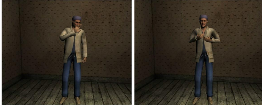
Fig. 4. Nonverbal behaviors animated on SmartBody

parser [22] to process the utterance. The parse tree is sent back and the NVB-Generator inserts time markers between every word of the utterance. Then the NVBGenerator analyzes the semantic and syntactic structure of the utterance to decide which rules could be fired and inserts XML tags for such rules. The XSLT processor looks at these rule tags and matches them to insert the BML codes into the output message. But if there are two rules that overlap with each other, the one with a higher priority will be selected.