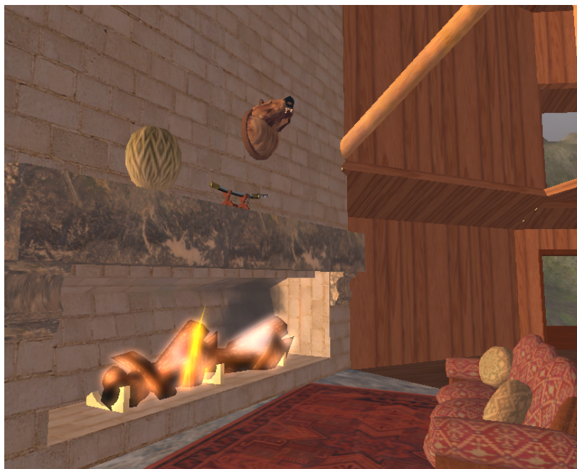
Figure 3. One of three fireplaces in the central section of the ski lodge, with animated fire accompanied by appropriate sounds of a crackling fire.