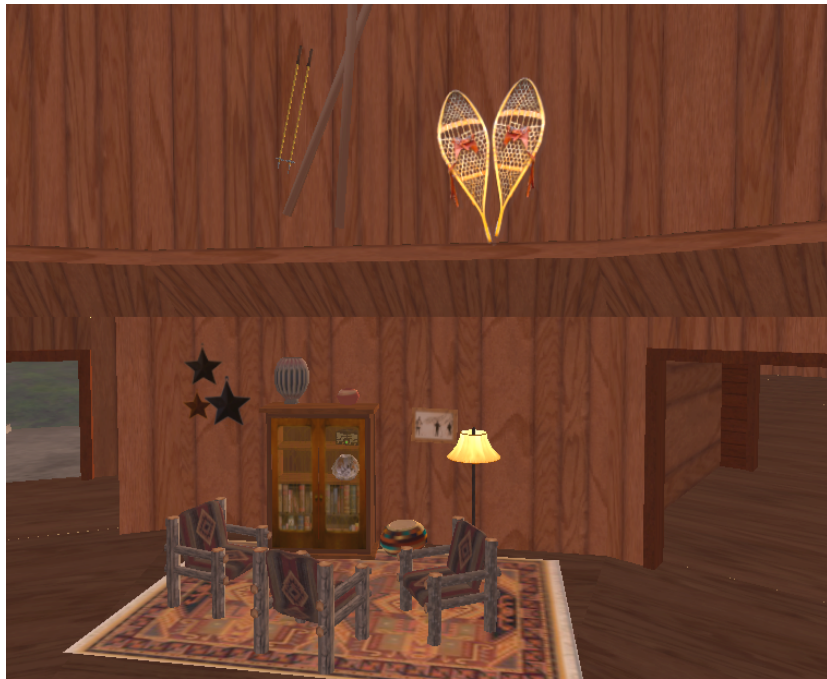
Figure 2. A small seating area in the center section of the lodge, designed to facilitate conversation, suitably decorated.