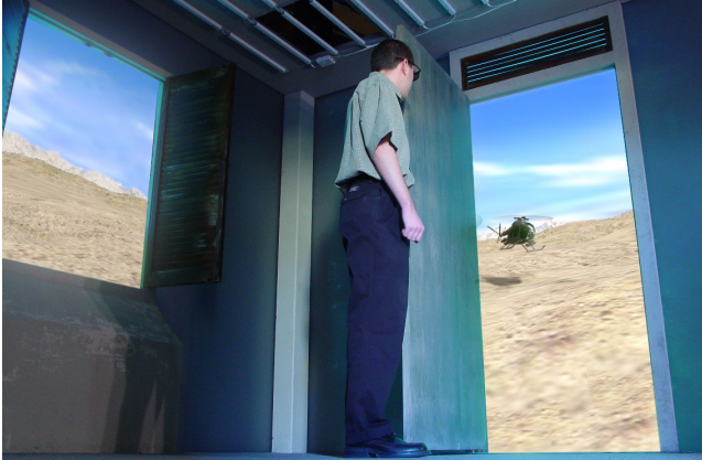
Figure 1: A virtual desert scene projected on two screens is merged with the real room environment's prop window and doorframe. In this setting, a pair of binoculars could help to survey the scenes.

In one of the FlatWorld applications, a physical room with real furniture is augmented with a virtual urban combat scene displayed on rear-projection screens situated in window frames. Soldiers trainees are required to survey a vast city scene and react to circumstances. Lighting conditions and the level of hostilities vary from scenario to scenario. Long range vision enhancement tools are critical to their tasks and should be analogous to the binoculars, night vision goggles, and laser range finders they use in the real physical world.