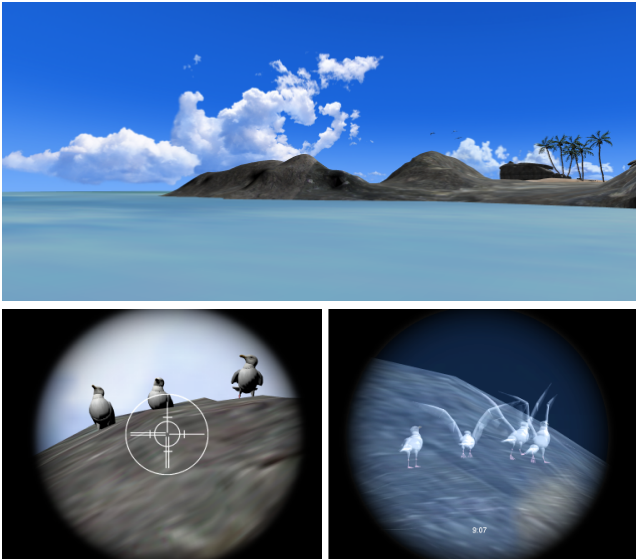
Figure 6: Top: approaching the Bird Island, panoramic view. Bottom: magnified view with a crosshair pointer for object selection (left); X-ray vision mode shows birds hidden behind the rock (right).

We believe that a large gamut of applications may benefit from our methods. These applications include professional skill training systems, educational tools, and interactive entertainment.