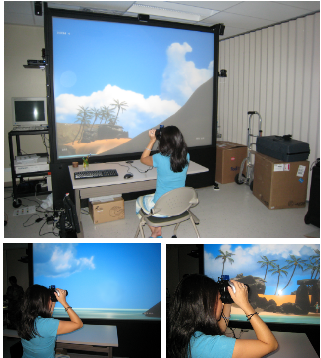
Figure 4: On a bird-watching mission, most players never turned the binoculars off for the whole duration of the trip.

To determine if a participant's background had significant influence on their evaluation, we performed the Welsh two-sample t-test grouping people as gamers, non-gamers, VR-experienced, VR-novices, experienced with binoculars, and