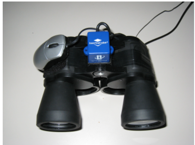
Figure 3: A pair of real binoculars with additional equipment for controlling virtual views. Mini-mouse buttons and wheel operate zoom, X-ray vision, snapshot mode, and ‘reality freezer’. Intersense InertiaCube 2 tracker is attached to the top. At the bottom, an additional pair of viewing tubes can be seen.

The 3D content was rendered at 25 FPS on a single PC with a 3.2 GHz CPU, 1GB RAM, and a nVidia Quadro NVS GPU, running customized Flatland engine [18]. Video and audio content was rendered with the OpenGL and OpenAL libraries. Dynamic sound localization was processed on the same PC.