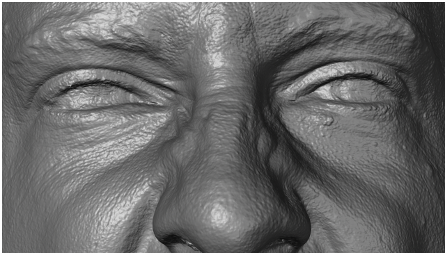
Figure 4: High-res facial geometry captured in Light Stage X.

State-of-the-art high-resolution facial scanning with polarized spherical gradient illumination extends the process to multi-view capture [Ghosh et al. 2011]. The polarization pattern of [Ma et al. 2007] achieves accurate diffuse/specular separation for only a frontal camera position, which required scanning the actor from three different angles to produce an ear-to-ear facial scan. [Ghosh et al. 2011] places a static vertical polarizer on a set of cameras placed around the equator of the light stage, and switches the light stage's illumination from horizontal to vertical polarization to tune the specular reflection in and out, allowing for simultaneous multi-view facial capture. This process is implemented by USC ICT's newest Light Stage X facial scanning system, which uses programmable light sources and interchangeable filters to electronically create any color, intensity, direction, and polarization of light across the incident sphere of illumination.