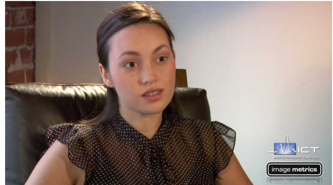
Figure 3: A rendering of a photoreal digital face from the Digital Emily project [Alexander et al. 2010].

be shot with standard digital SLR cameras in just a few seconds, allowing natural facial expressions to be captured, and each scan yields properly aligned texture maps of the skin's diffuse and specular albedo. Combined with global illumination rendering and subsurface scattering simulation [Jensen et al. 2001], realistic facial renderings can be generated from such data.