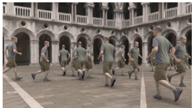
Figure 2: Animated digital humans rendered from arbitrary viewpoints and illumination from Light Stage 6 data.