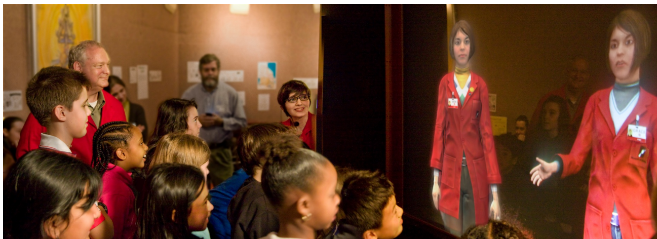
Figure 1: Visitors talking to the Twins at the Museum of Science. Picture from Swartout et al. (2010), Figure 6, page 297.

Speech recognition (2) was performed by the SONIC toolkit (Pellom and Hacıoğlu, 2001/2005) until December 2010, and thereafter by OtoSense, a recognition engine that is currently being developed by USC; using OtoSense allowed appropriate customization of the speech processing front-end for the needs of the setup at the museum. Natural language understanding (3) and dialogue management (4) are integrated in a single component, NPCEditor (Leuski and Traum, 2010), a text classification system that drives virtual characters and is freely available for research