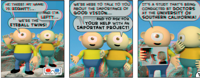
Figure 1. MEPEDS 3D comic strip