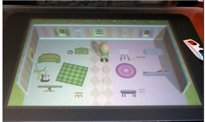
Figure 3. Lefty and Righty at 'home' on the Microsoft Surface

Although it is possible to treat the projection surface of a phantogram as a window on a virtual world (just like a normal upright screen), it is most effective when the ground plane is matched with the screen surface, which results in all other virtual objects being placed stereoscopically in front of that surface. In other words, every object other than the ground plane has negative parallax (where the left eye image appears to the right of the right eye image). Because the stereoscopic illusion breaks down when objects having negative parallax are clipped by the projection edge (since they cannot be simultaneously in front of and in back of the screen edge), it is preferable, if not necessary, to keep objects contained entirely within the projected area.