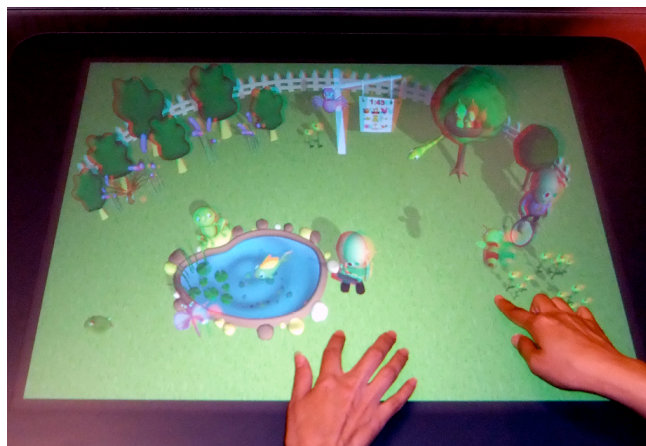
Figure 4. Lefty and Righty in the garden

We considered treating the table surface as a transparent ceiling, with the garden scene and characters placed below it (with positive parallax), but it was found that this largely removed any sense that the space of the game was contiguous with our own world. Eventually we accepted the inevitability of these occlusions, and instead focused on methods for minimizing their occurrence and duration. Therefore, actions that required the user to continuously touch the character (such as pushing or grabbing) were rejected, in favor of actions that encouraged users to touch the flat ground plane instead.