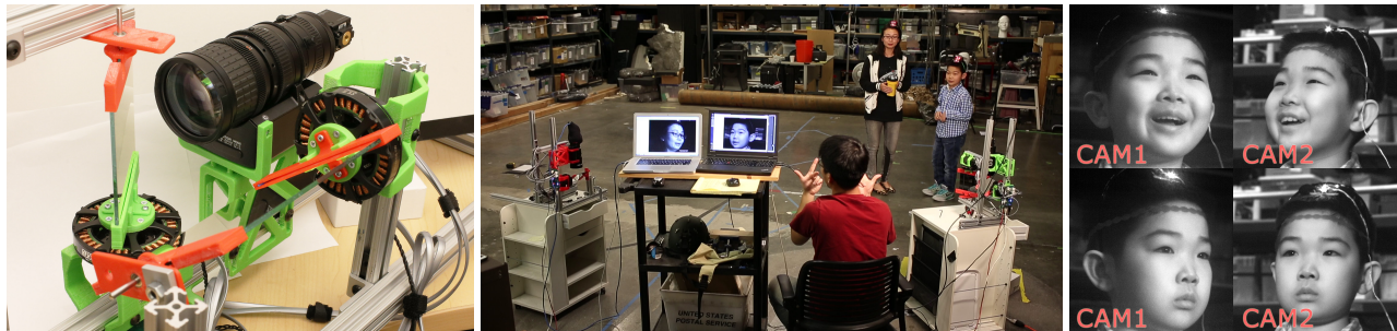
Figure 1: (Left) A stationary camera with an instrumented zoom & focus lens attached to motorized pan/tilt mirrors. (Middle) Two units of our virtual head-mount camera setup in a performance capture stage for facial tracking. (Right) Frames from a tracked facial performance.